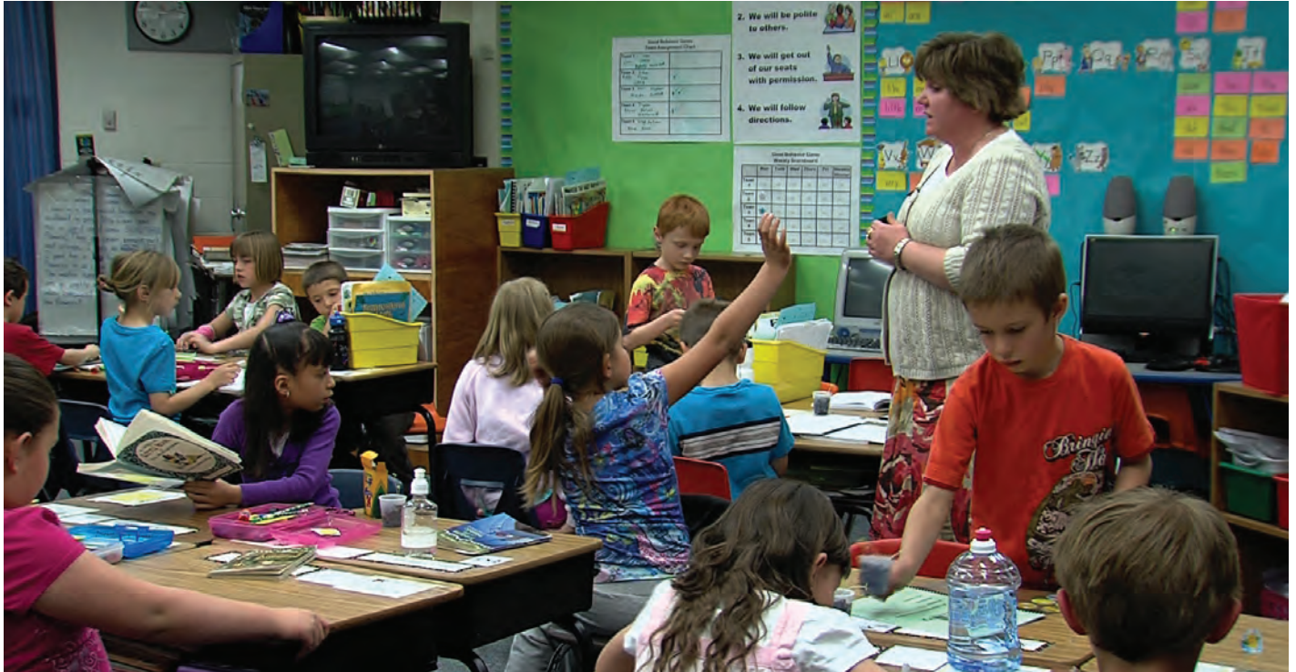
A classroom playing the Good Behavior Game in Denver.

The GBG was developed to help teachers manage classrooms without having to respond on an individual basis each time a student disrupted class.